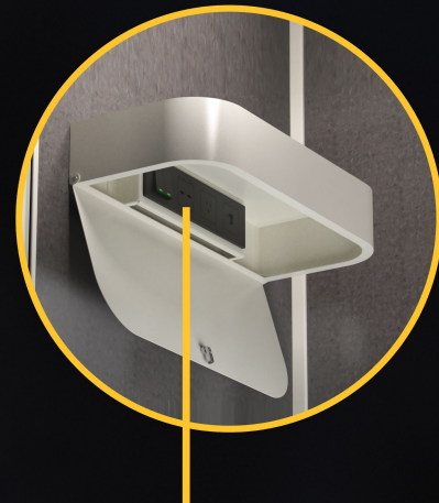
POWER SOCKET WILL FIX INSIDE THE COUNTERTOP