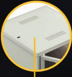
ROOF MOUNTED POWER SUPPLY CORD