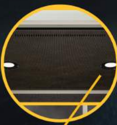
OPTIONAL SECURITY COVERS ON LIGHTS