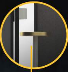
BOLT DOWN STOOL