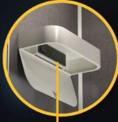
SECURE POWER DATA WITHIN COUNTERTOP